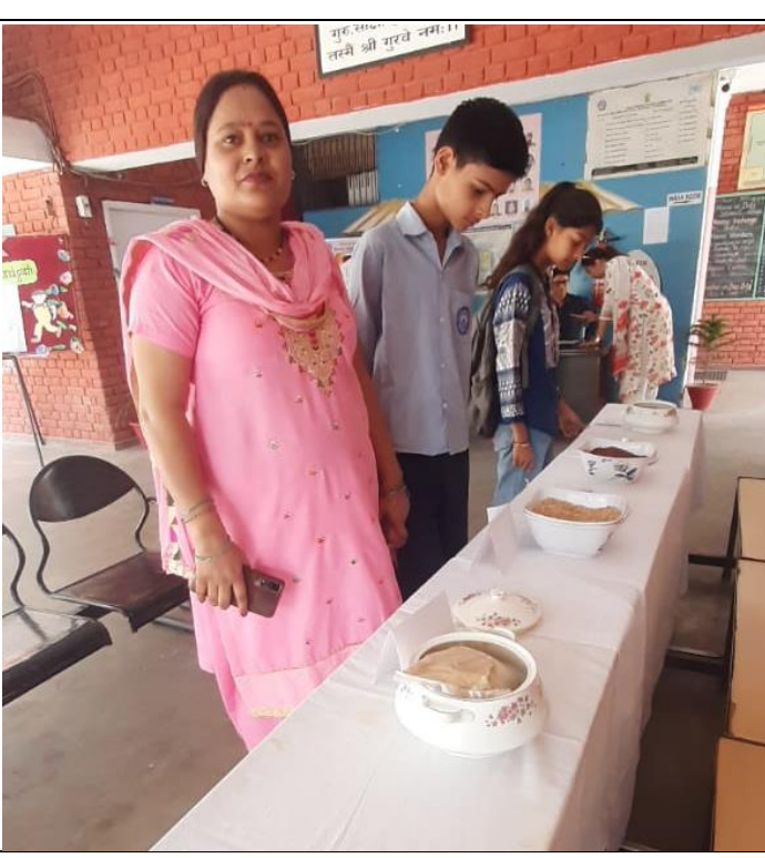
Event on highlighting Millets as Poshtik Sampuran Aahaar